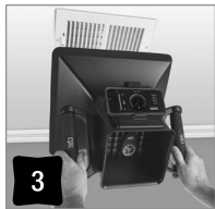
Capture airflow readings