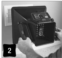
Capture Airflow Readings