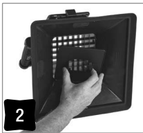
Low Volume Adapter