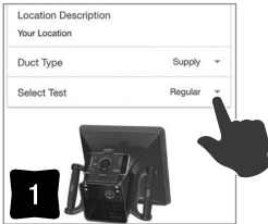
ABM EasyHood Main Screen