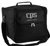
Padded Carrying Case