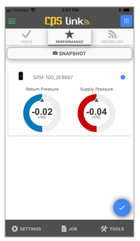
Pressure Differential Test