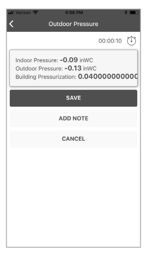
Indoor Vs Outdoor Pressure Test