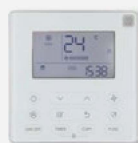
WIRED CONTROLLER KJR-120X2 (OPTION)