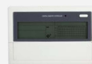
CENTRAL CONTROLLER CCM03 (OPTION)