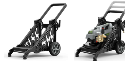
Dolly is available separately Model No: Dolly110