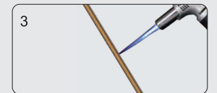
3 ■ Prepare the tube to be expanded by heating it.