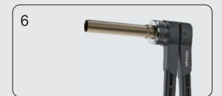
6 ■ Press the handle down to expand the tube, allowing it to be connected with out fittings.