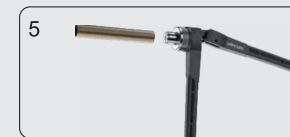
5 ■ Open the expander's handle to 90° and insert the tube onto the expander head.