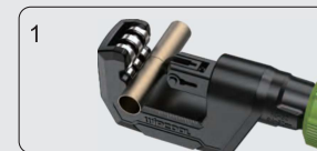
1 ■ Cut the tube

Scope of application: For soft and copper / aluminum pipes.