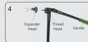
4 ■ Place the appropriate expander head onto the expander.