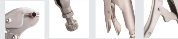
Flat bites Hex key adjusting screw Fast unlock trigger Harden stress rod